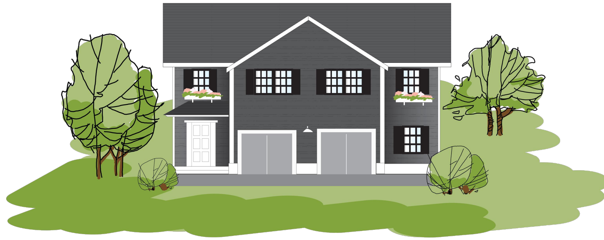
HOLLY STREET, WAKEFIELD, RI Front View