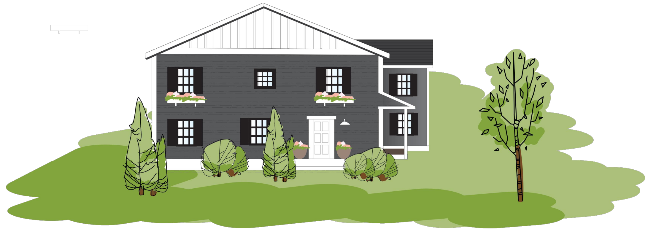
HOLLY STREET, WAKEFIELD, RI Side View