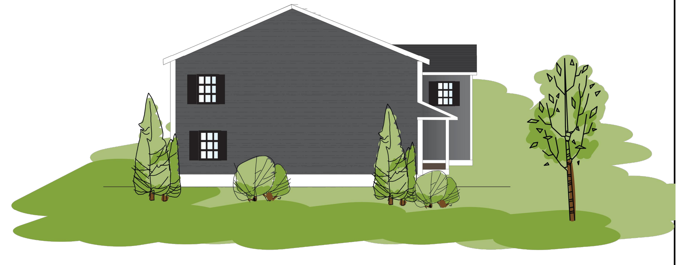
HOLLY STREET, WAKEFIELD, RI Side View