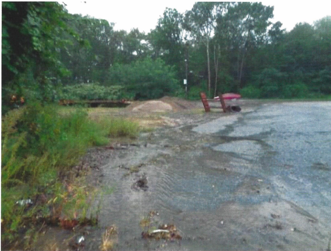
View from lot (R10 boundary) to Rt 108 (see red vehicle passing south on Rt 108) Street water runoff and rain water from Tower Hill Landing flow up to East Farm marsh then to Sugatucket Pond. Terrain slope facilitates water build up from surrounding Buildings #1 and #2 and RT 108 roadway.

Storm Water Management area located on the North East Lot must be expanded to provide filtering and watershed recharging for stormwater from Rt 108 and from 2 adjacent buildings as well as the new development. The current depiction needs to be increased by the sacrifice of 4 proposed parking slots. In 2015, I took photos to document how water was entering and being abated in this lot. The picture below with 2 cars parked is farther south than proposed 2020 stormwater retention area. The photo delineates how water is recharging the watershed from the street addition from existing structures (Bld #1 and #2) along the former southern Zone R10 line boundary with the.