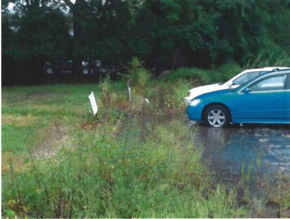
Rain run off recharging ground estuary from Building 1 and 2