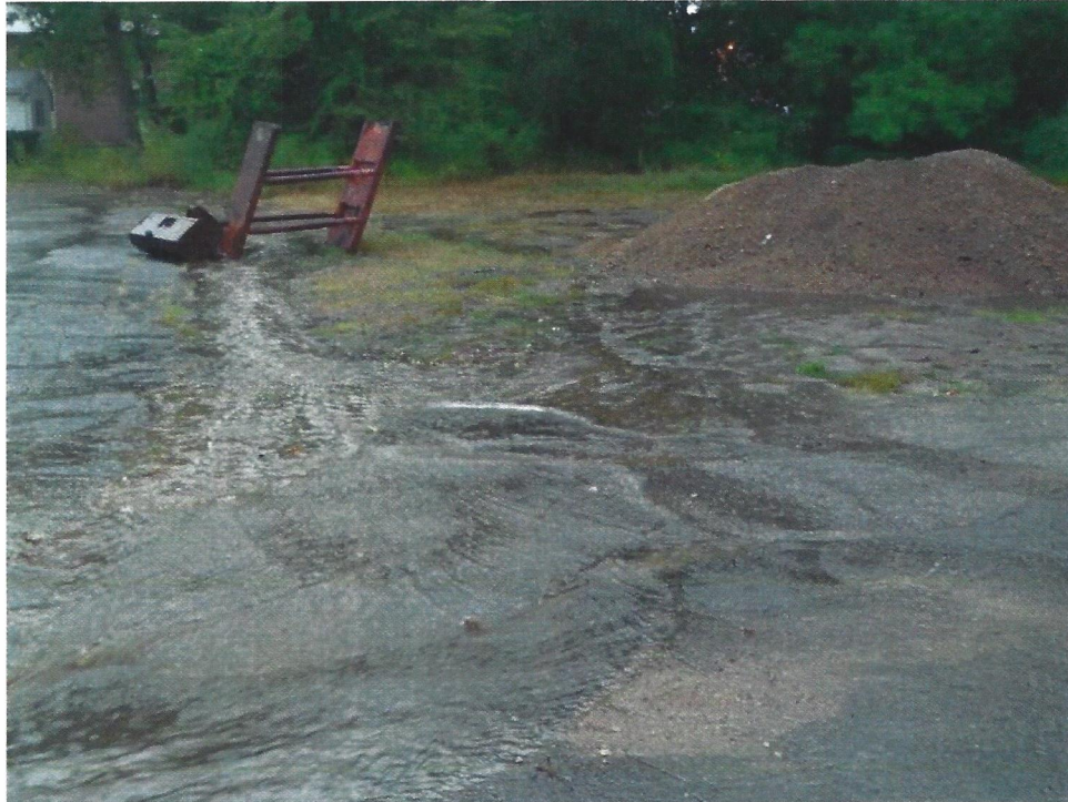
Note: Run off from RT 108 flows into R10 lot at southern boundary that recharges watershed.