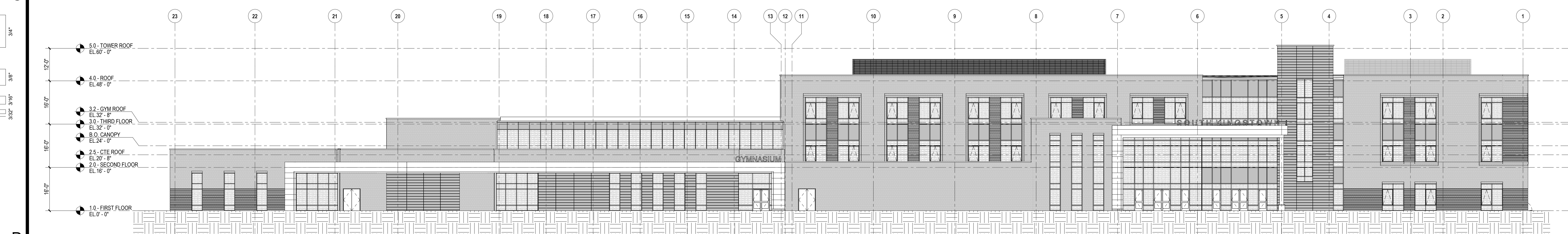
1D OVERALL NORTH ELEVATION 1/16" = 1'-0"