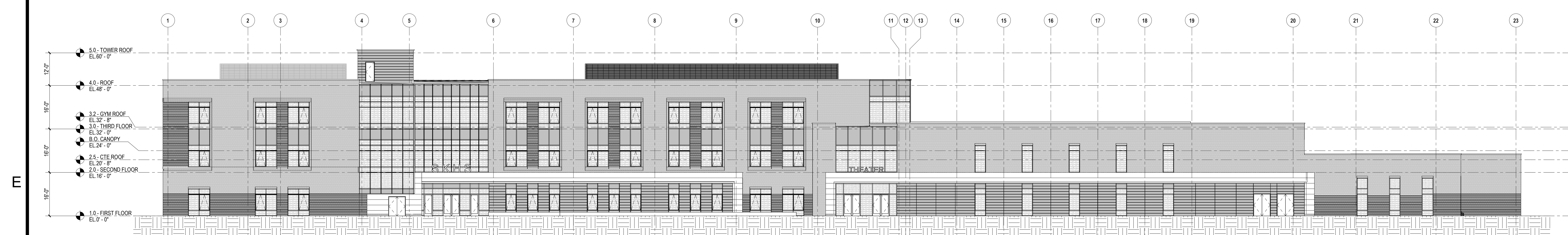
1E OVERALL SOUTH ELEVATION 1/16" = 1'-0"