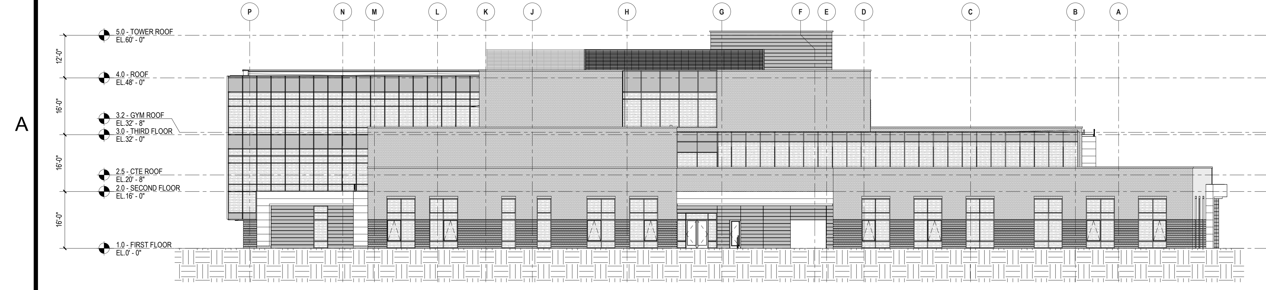
1B OVERALL EAST ELEVATION 1/16" = 1'-0"