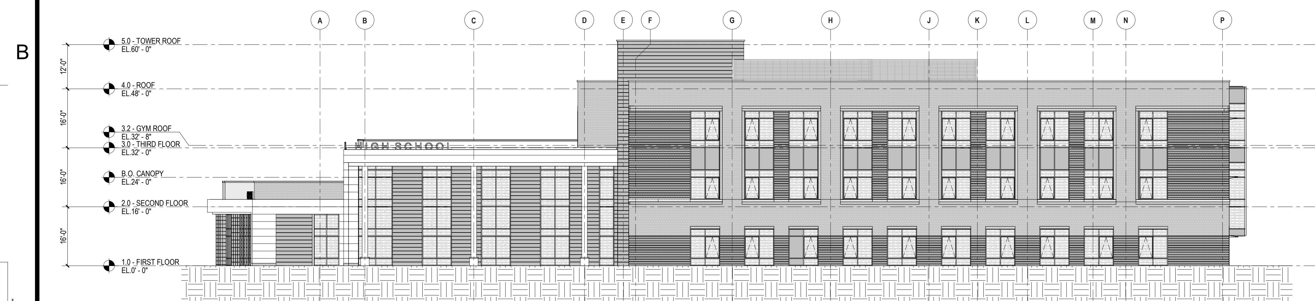
1C OVERALL WEST ELEVATION 1/16" = 1'-0"