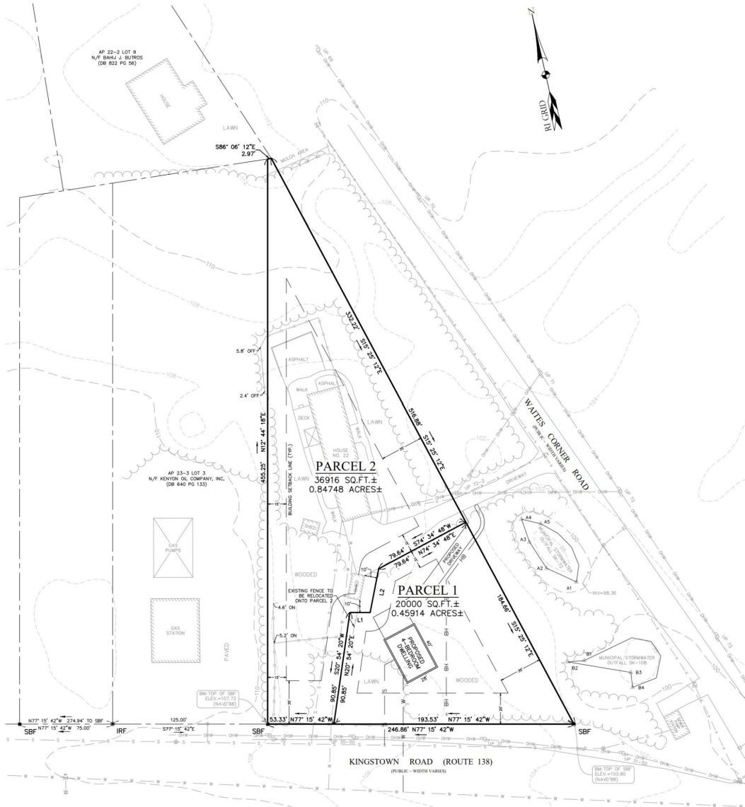
Figure 2: Option 2

Table 2 summarizes the proposed parcel areas and frontages.